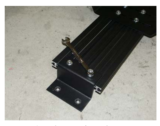
Attach extrusion adapter bracket to 18" section of extrusion using (2) 1/4" x 3/4" bolts and serrated nuts. (7/16" Wrench)